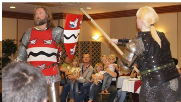
Lady Jannicke triumphs